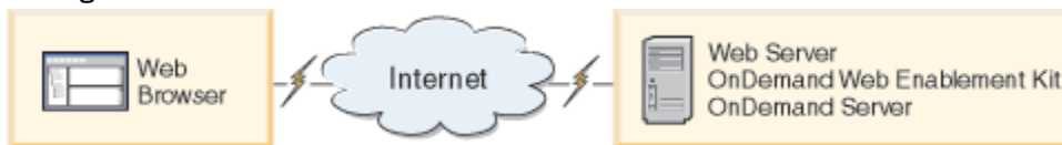
Figure 1: Accessing data stored in Content Manager OnDemand by using ODWEK

The following figure illustrates how a workstation with a web browser accesses data stored in a Content Manager OnDemand server.